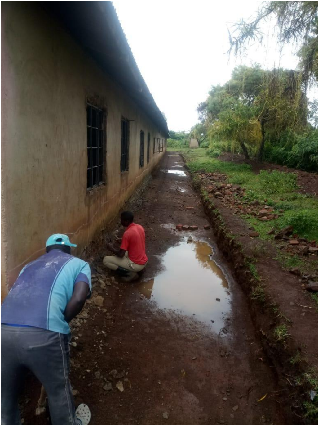
Initial Rehabilitation works in Nyang'inja Primary School in Katuk.

PROJECT “COVID KATUK”. We made a fundraising campaign to help our counterpart association “Dignity Katuk CBO”, to fight against covid in Katuk, targeting the most vulnerable families. The funds were invested in buying 40 water tanks (50 Litres each) with metal stools and soap bars. There were also hand washing promotion workshops. “Dignity Katuk CBO” elaborated a video about the project that can be seen in the following link. https://youtu.be/6S_yVOO7bXU