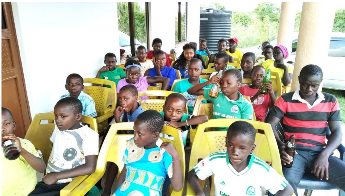
Meeting with children of Watoto program in Katuk