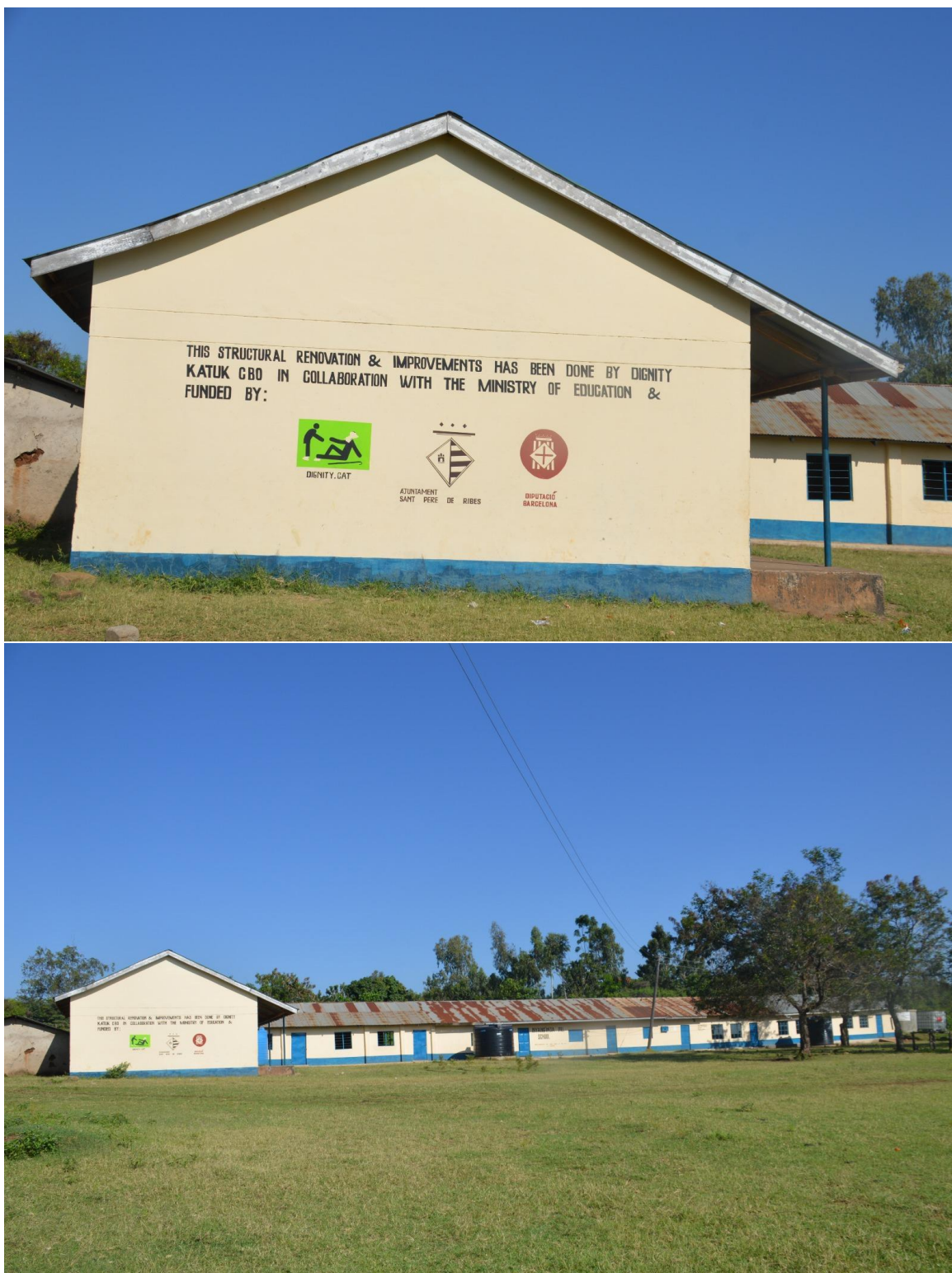
Final new look of Nyang'inja Primary School