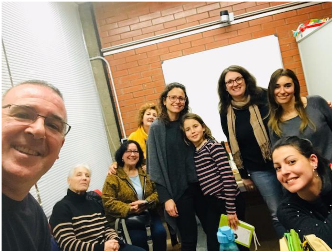
General Assembly 2019 held in “El Local” in Sant Pere de Ribes

During January we celebrated the general assembly for 2019. We made a review of the objectives of the association, the activities, and the way forwards. Apart from board members, other people also assisted interested in knowing about the association.