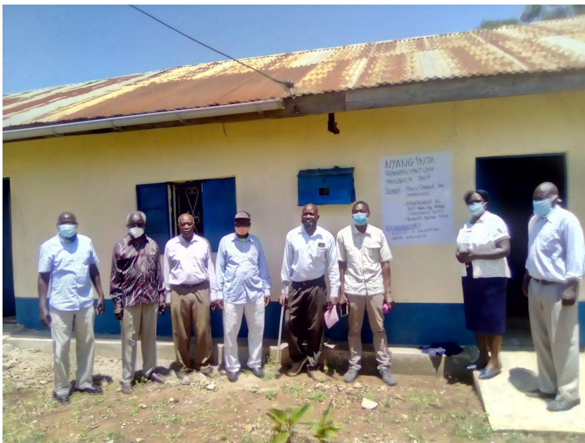
Official handover of the renovation works of the project nº 3407, Nyang'inja Primary School