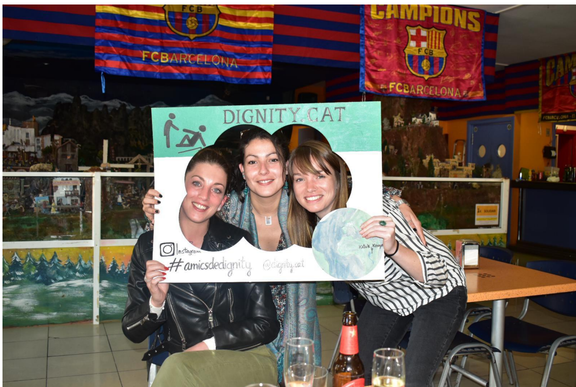
Solidary Calçotada 2020 in El Casal de Canyelles